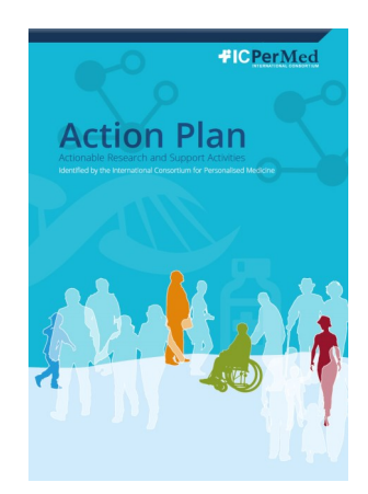
Download the Action Plan

The 22 research activities and 8 supporting activities of ICPerMed's Action Plan span the whole healthcare value chain, from basic research to clinical research and market access, and also take into account patient empowerment and sustainability of healthcare systems. They address prevention, diagnosis, treatment and care.