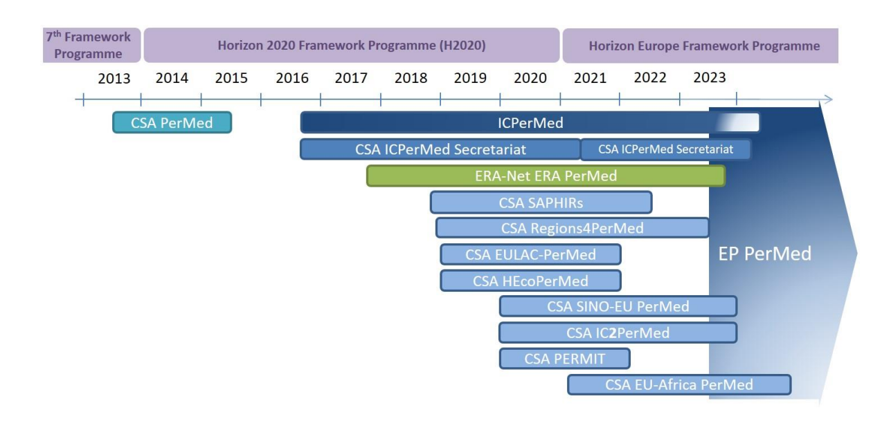
Fig. 2 Runtime of ICPerMed Family members.

Most ICPerMed related initiatives have been initiated during the Horizon 2020 Framework Programme and will run until 2022 or 2023 (see Fig. 2). Thus, the second ICPerMed Family meeting is planned for 2023 to exchange the partially final results of the ICPerMed related CSAs and to discuss possible further collaborations. In this regard, the start of EP PerMed is planned for the end of 2023 providing an excellent opportunity to continue and ensure collaboration to foster PM implementation for the benefit of patients and citizens. The preparations for the partnership have just gathered momentum and the report of the ICPerMed Family meeting will be sent to the newly established EP PerMed drafting group, in order to support the process and establish a continuous collaboration between ICPerMed and the Drafting Group.